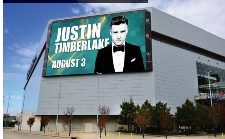
EXTERIOR LED MEGA BOARD